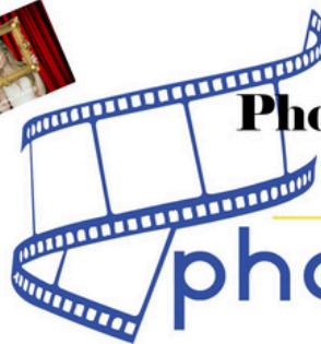
Photo B 0 0th Hire